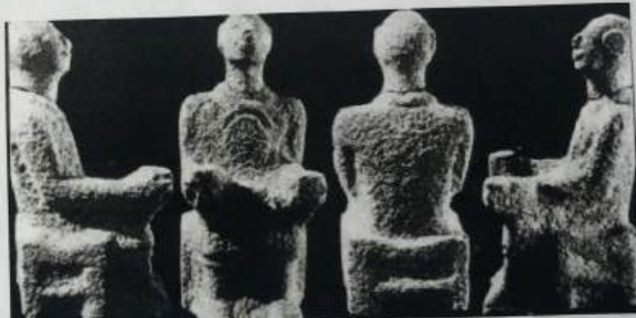
The moon-god from all four sides. Note the crescent moon carved on his chest.

Referendums abolish fraud 37:48, 38:52, 4:34, 25:4-5 islam idolatry deny ORIGIN GOD GENESIS.