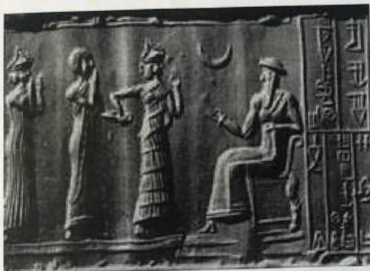
moon god/al-ilah/allah is same today

Good people stop evil, like GOD does, Saint Matthew 13:49. "And be ye kind to one another, tenderhearted, forgiving one another, even as God for Christ's sake, hath forgiven you." Ephesians 4:32, by Holiest of Holy † Forgives sin saves Muslims.